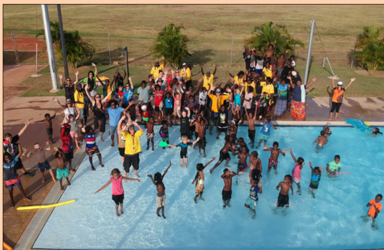
Maningrida held its fourth School Attendance Party of the year on June 27.

Hope to see you all again at the next attendance party.