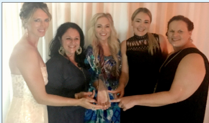
Energy Resources of Australia's finalists and winners at the Northern Territory Women in Resources Awards recently.