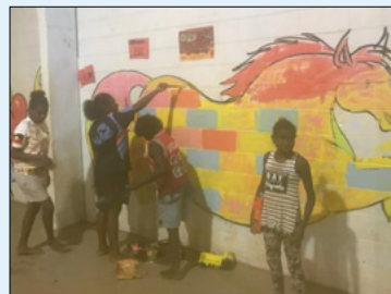
The Warruwi Recreational Hall now proudly features incredible murals, designed by the local youth.