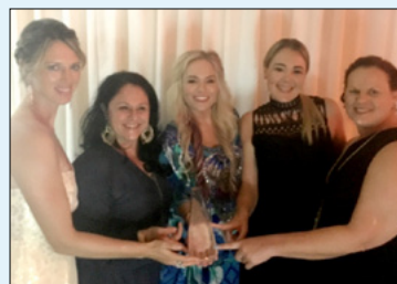
ERA celebrates finalists and winners at the Northern Territory Women in Resources Awards.