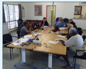
Local Authority meetings continue throughout West Arnhem communities.