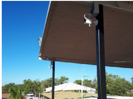
Cameras installed by ERA will improve safety and help to reduce unexpected aircraft cancellations or delays into and out of the airport.

Pilots are able to simply login to the website and see the live feed for the latest visuals on the runway and any weather