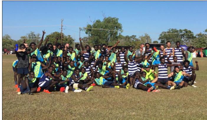
Adjumarllarl Dingos AFL team pictured with the Groote team at the 30th Anniversary Barunga Festival recently.

Barunga Festival the young men began their quest. With a team that fluctuated at training sessions between 40 and 15 they toiled away at their fitness. Finally it was time to load the swags and camp trailer. The 30 strong Adjumarllarl Dingos AFL team were ready for Barunga Festival and a weekend of sport, culture, camping and music.