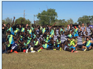
Gunbalanya's Adjumarllari Dingos AFL team take on Barunga Festival.