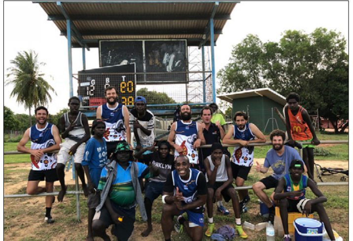
Maningrida held its season-ending footy Grand Final on June 23 after a five-month long season in 2018.