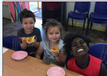
Gunbalanya Youth Centre filled the school holidays with plenty for the community to enjoy.