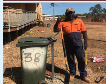
More than 120 wheelie bin stands have been distributed throughout Waruwi.