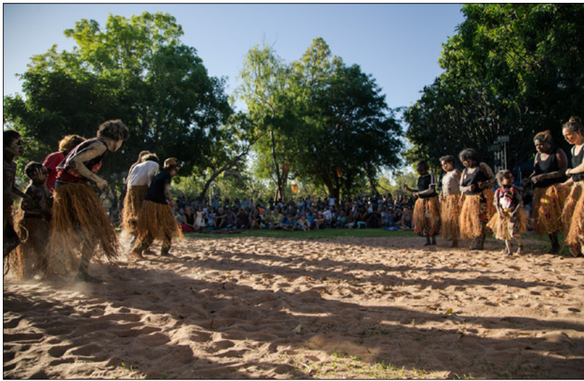
Mahbilil Festival is a family friendly event crammed with activities, workshops for kids, displays, Indigenous art exhibitions and demonstrations of weaving, painting and crafts.

prominently with large earth ovens cooking buffalo, barramundi and the speciality of the region, magpie goose.