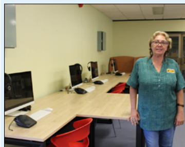
New additions to the multimedia aspects of the Jabiru Public Library.