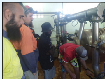
Maningrida holds intensive four day Aquatic Technical Operator Training recently.