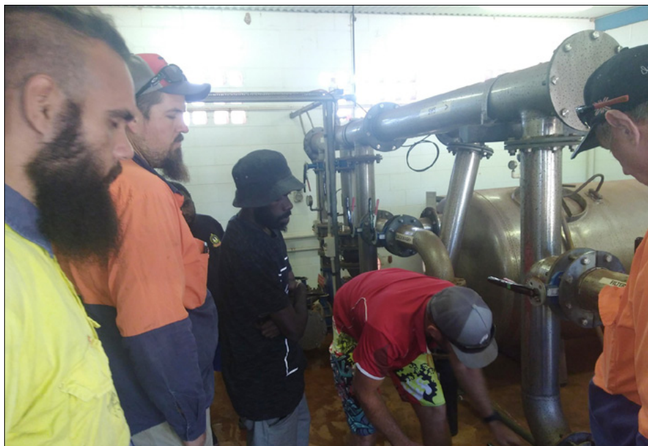
Maningrida community members, pool lifeguards and West Arnhem Regional Council (WARC) staff from core services participated in an intensive four day Aquatic Technical Operator Training.

Maningrida community members, pool lifeguards and West Arnhem Regional Council (WARC) staff from core services participated in an intensive four day Aquatic Technical Operator Training at Maningrida Pool recently.