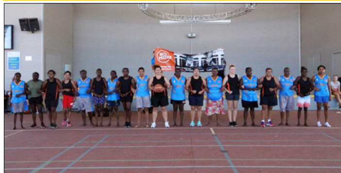
The 2017 women's grand final game saw the Jabiru and Warruwi teams linking arms in support of the 'No More Violence' campaign.