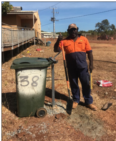
Pictured is the very first bin stand which was installed in the community.

"The bin stands are already proving to be extremely beneficial.."