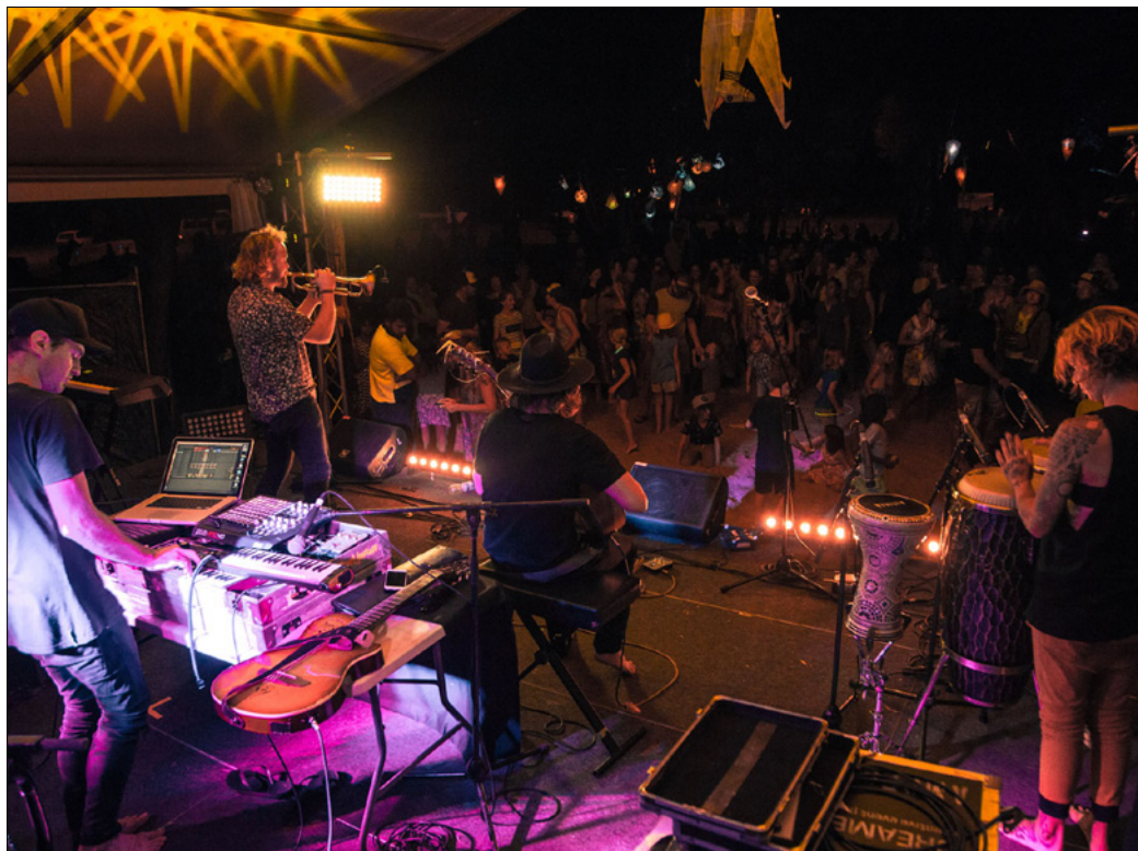
The highly-anticipated Mahbilil Festival will return to Jabiru on Saturday, 1 September to celebrate Kakadu culture, both traditional and contemporary. The huge event will take place at Jabiru's Alberto Luglietti Memorial Pool grassed area and will run in conjunction with the Kurrung Sports Carnival. See more Page 7.