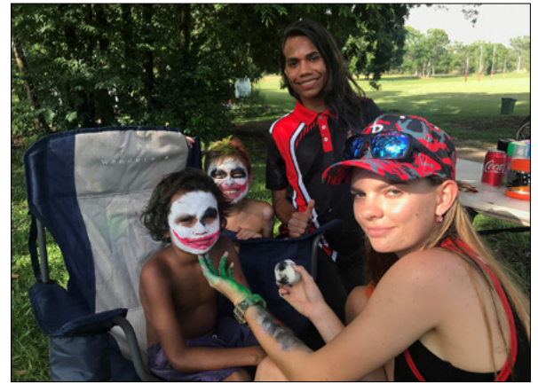
The younger ones taking advantage of the face painting.