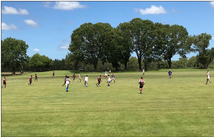
The Jabiru Bombers played their final home game against arch rival Banks Bulldogs on the weekend.