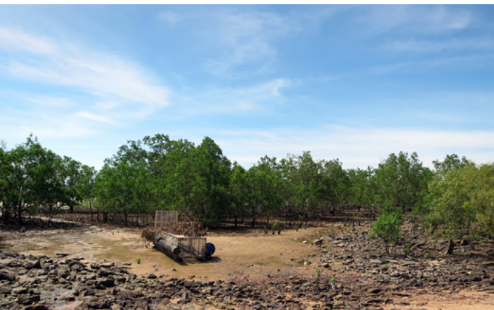
Things have changed since you were young. This trap needed to be set near houses at Maningrida.

Commercial hunting of saltwater crocodiles started in 1945. Before this there were about 100,000 crocs in the Top End but by 1971 there was only around 3000 left and they were almost extinct.