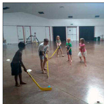
Jabiru youth playing indoor hockey.

Some of the many benefits of participating in sport and recreation activities revolve around health and fitness including reduced risk of obesity, increased cardiovascular fitness, healthy growth of bones, muscles, ligaments and tendons, improved coordination and balance.