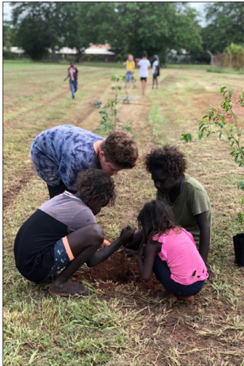
The children who were involved carefully planned out where they thought would be best to plant.

The trees are a part of the Maningrida beautification project which was made possible by the Maningrida Local Authority.