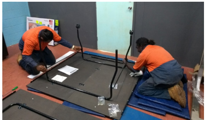
The WARC Works crew assembling new equipment in the 'chill space'.

There have been some exciting renovations under way this month at the Warruwi recreation hall. The two rooms at the front of the entrance, which were previously used as storage spaces, have now become a future 'chill space'. The sport and recreation team have been busy organising this room for the youth recently.