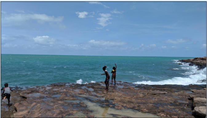
Warruwi students taking advantage of their beautiful surroundings.