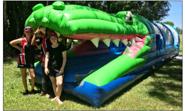
Enjoying the inflatable slip and slide.