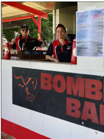
Below, the hardworking Jabiru Bombers committee members.