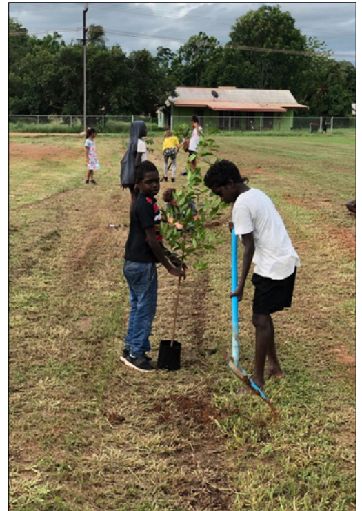
Children from Maningrida were kept busy planting native trees around the community.