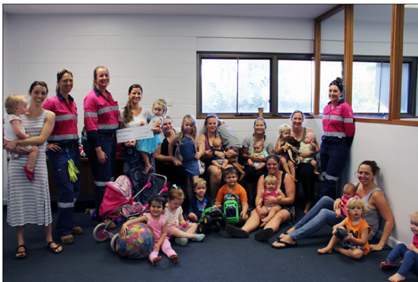
Members from the Ranger Women's Network handing over the donation to the Jabiru Playgroup members at the Courthouse recently. Playgroup is held each Tuesday at the Courthouse during the wet season and at Jabiru Lake in the dry season.

The cheques were handed out at a lovely presentation with the playgroup and the junior rugby union recently and each group received $1205.