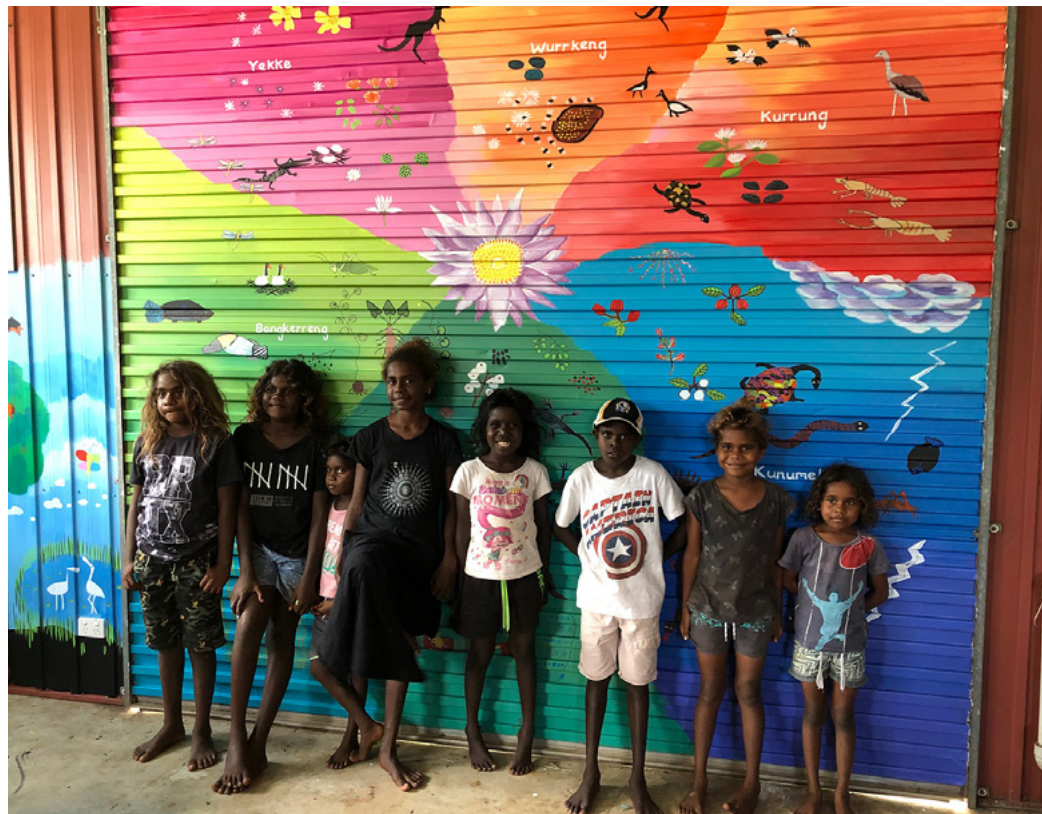
Youth in Gunbalanya worked alongside artists from Corrugated Iron Youth Arts recently to reinvigorate the Youth Centre and used film and paint to tell some stories about the Gunbalanya community.