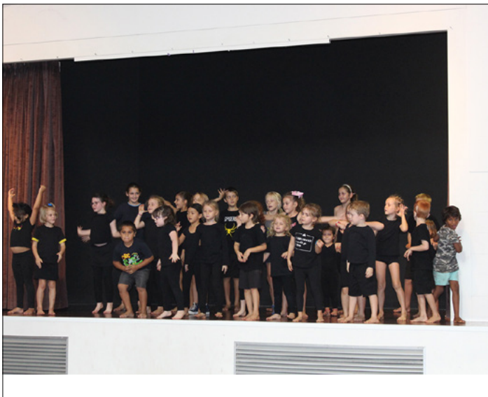
The Jabiru youth performing on stage as part of the Rix Kix Arts visit recently where they learnt plenty of new dance moves.

Youth in the Jabiru community were treated to two weeks' of free dance workshops facilitated by Rix Kix Arts recently.