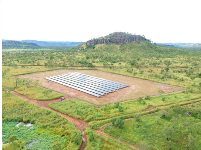
Solar PV panels constructed in Gunbalanya as part of the Solar Energy Transformation Program (SETuP). The program was rolled out to 25 sites across the Territory.

SETuP integrates 10MW of solar PV in remote locations