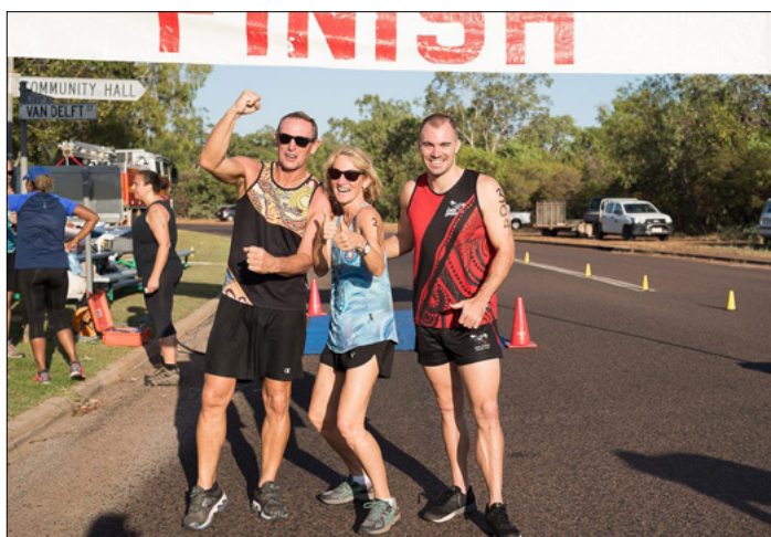
Time is running out to register for the 2019 Kakadu Triathlon which will be held in Jabiru on Saturday, May 11.