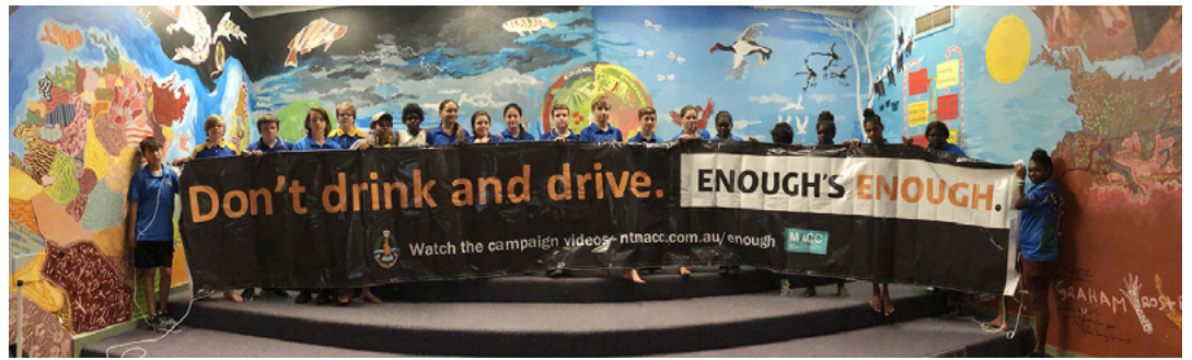
Jabiru Area School students holding the 'Enough is Enough' campaign banner which reinforces road safety messages.

Over the past couple of years in Arnhem Land communities, the Car Seats for Kids program (Booster seats and baby capsules supplied and fitted), and the Enough is Enough campaign, has provided a lot of education and support for