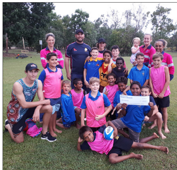
The Jabiru Bushratz Junior Rugby Union team was presented with a cheque thanks to the Rangers Women's Network recently.