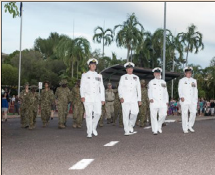
ANZAC Day commemorative services will be held in West Arnhem communities on April 25, including Jabiru, Maningrida, Warruwi and Minjilang.

If you have an upcoming event you would like to see listed in this space please phone the Wire on 8979 9465 or email wire@westarnhem.nt.gov.au .