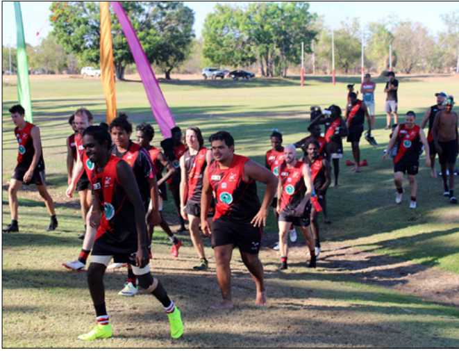
The Jabiru Bombers exiting the field as the men's AFL Runners Up at the 2019 Kurrung Sports Carnival at Brockman Oval.