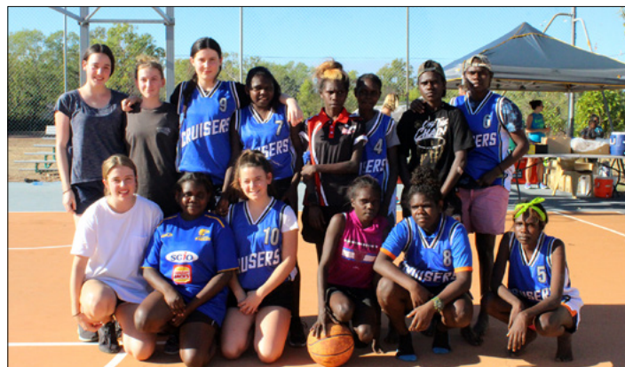
Jabiru Area School joined with a visiting school to form the Jabiru Sacred Hearts team in the women's basketball competition.