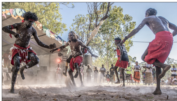
The traditional dancers Gunborrk at the Mahbilil Festival wowed the huge crowd which was estimated to be around 2500 people throughout the day.