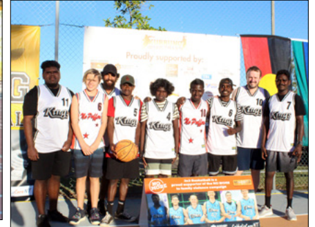
Jabiru's You Got Schooled team taking part in the men's basketball competition at Kurrung.