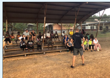
Road Safety NT visits Maningrida youth to spread life-saving messages.