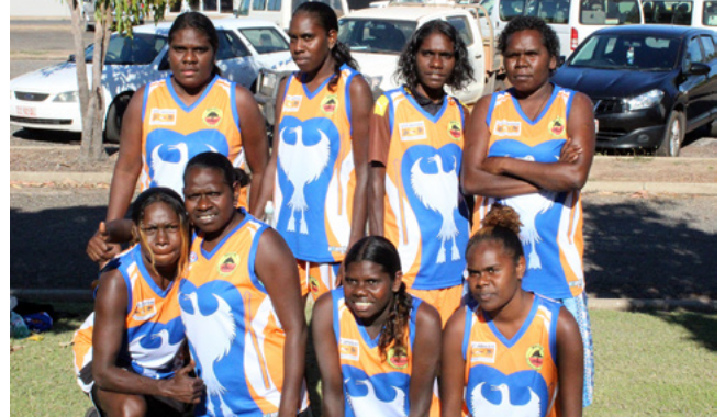
The Maningrida All Stars women's basketball team coming together for a photo before the competition got under way.