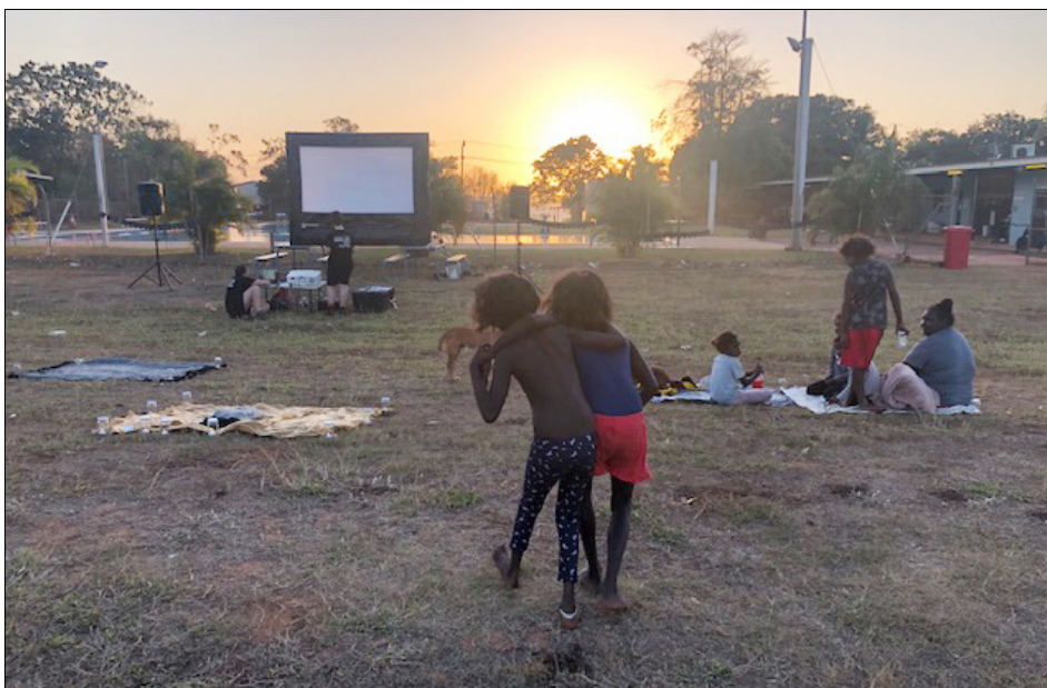
The Maningrida community were treated to a lovely evening under the stars during the recent visit from the NT Travelling Film Festival.

Maningrida were treated to an exciting visit from the NT Travelling Film Festival recently which saw around 150 community members come together for the night.