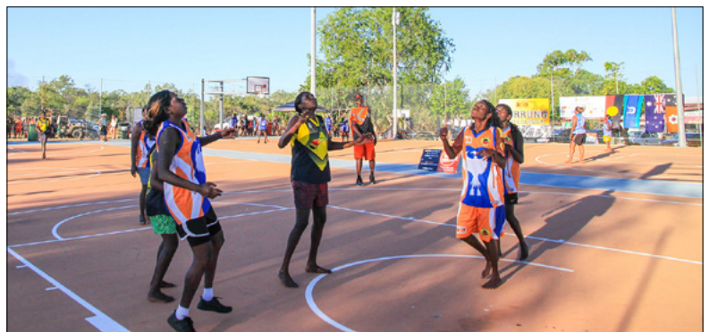
The Maningrida and Minjilang women's basketball teams battle it out at the Jabiru courts in front of a great crowd at the 2019 Kurrung Sports Carnival.