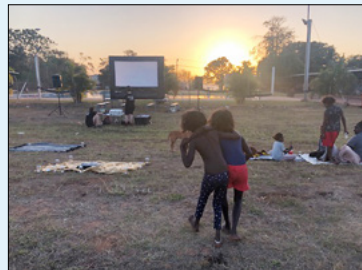
Maningrida were treated to an exciting visit from the NT Travelling Film Festival recently.