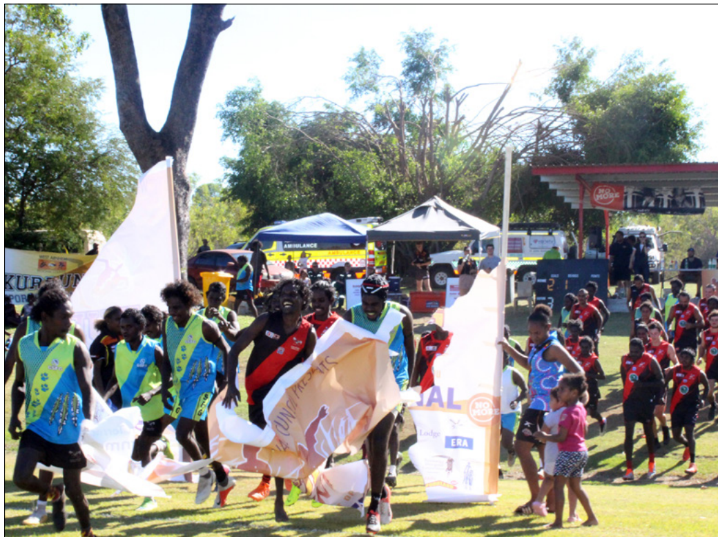
The 10 year anniversary event of the Kurrung Sports Carnival was held on August 30 and 31 with 14 teams competing. Pictured is the beginning on the AFL grand final game between the Jabiru Bombers and Gunbalanya at Brockman Oval. Full story and pictures on Pages 8-10.