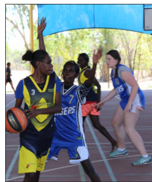
Minjilang taking on the Jabiru Sacred Hearts in the women's basketball competition.