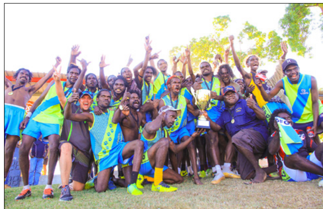
Gunbalanya's men's AFL team celebrating their success after winning the grand final game against the Jabiru Bombers.