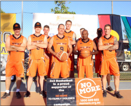
The NORFORCE team from Darwin taking part in the men's basketball competition for the first time.