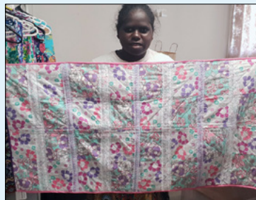
The ladies in Gunbalanya have been extremely busy producing handmade items for their first order.