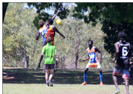
Maningrida taking on the Beswick Wugularr Hawks at Brockman Oval in the hotly-contested men's AFL competition.