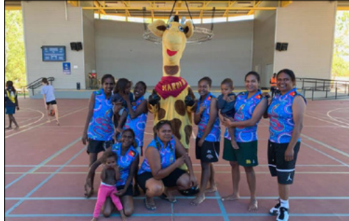
Healthy Harold was a special visitor to the Kurrung Sports Carnival this year. He is pictured with the Waruwi women's basketball team.