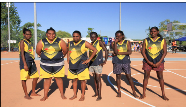
Minjilang's women's basketball team taking the court in uniform at the 2019 Kurrung Sports Carnival.