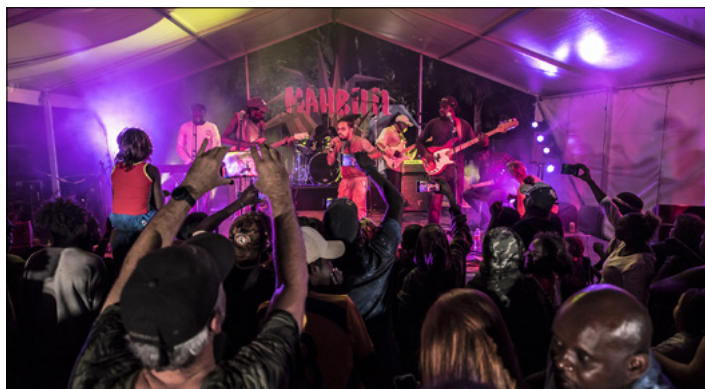
The Black Rock Band were featured in the music line up and certainly didn't disappoint the crowd at the 2019 Mahbilil Festival.