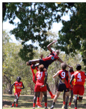
Minjilang Suns versing the Jabiru Bombers in the men's AFL at Brockman Oval.