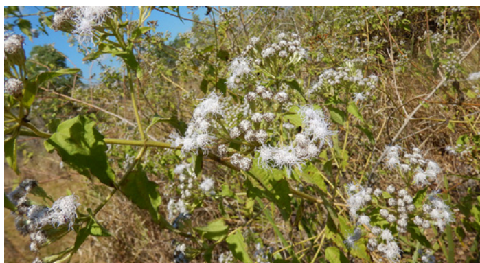
Siam weed has recently been detected in the Northern Territory.

The Weed Management Branch has notified the National