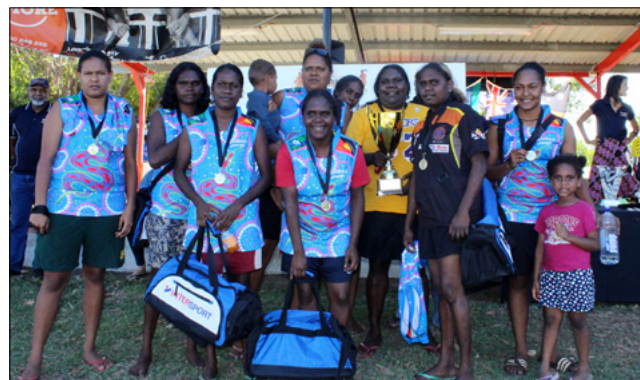
Defending champions Waruwi's Mardbalk Serpents continued their winning streak to take out the grand final in the women's basketball competition.