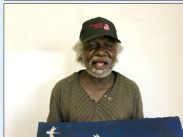
The date for Kakadu Bird Week has been set for 2019 and the full program is coming soon.