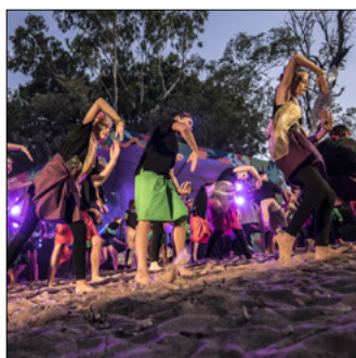
Jabiru Area School performing at the 2019 Mahbilil Festival.