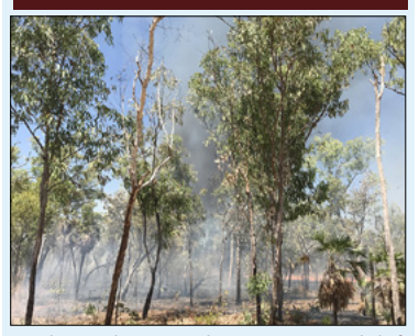
Residents and visitors to the region are reminded of the seriousness of fire safety at this time of year.