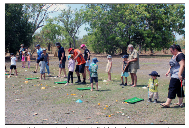
Junior golf, facilitated at the Jabiru Golf club, has been a very popular activity during the current school holidays.

Thank you very much to everyone in the community who has supported this program as it would not be possible without this assistance.