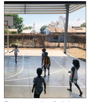
The young people in Gunbalanya trying out the new basketball court.

The most exciting news that current basketball competitions can continue