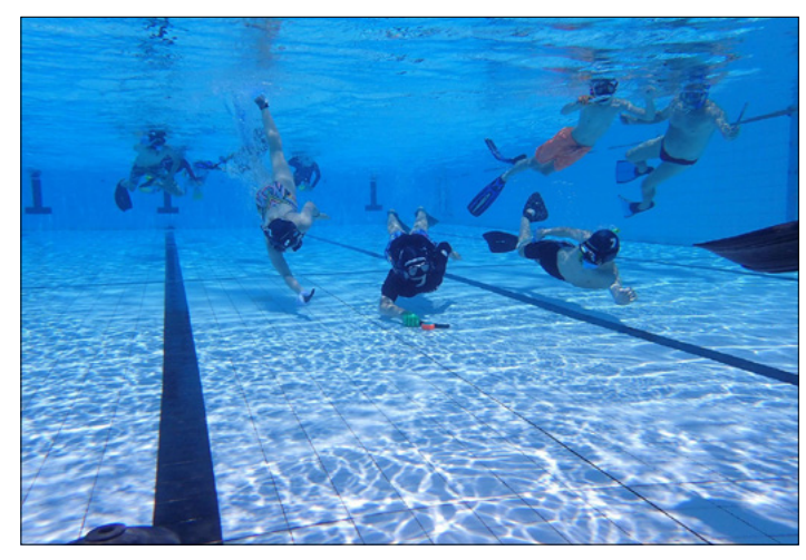
The first underwater hockey invitational cup was held in Jabiru on 28 September.

The success of this new sport to the area, gained immediate media support and curiosity and, since the inception of UWH in Jabiru, there is now a NT UWH commission, 3 local players attending the 2020 Nationals, and a Darwin club