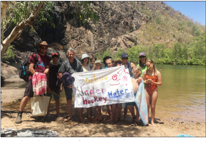
Around 30 players coming from Cairns, Sydney, ACT, Wollongong, Margaret River and Darwin in Jabiru for the invitational cup.

UWH is played every Wednesday from 5pm to 6pm, and T-shirts can be purchased from Foodland.