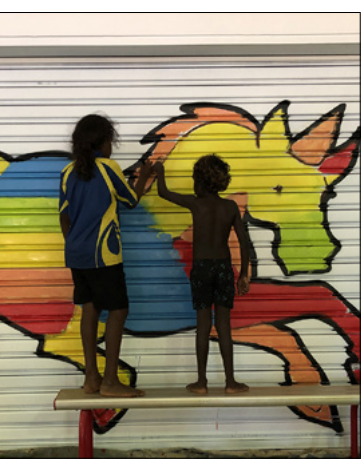
Young people in Minjilang taking part in the mural painting at the recreation