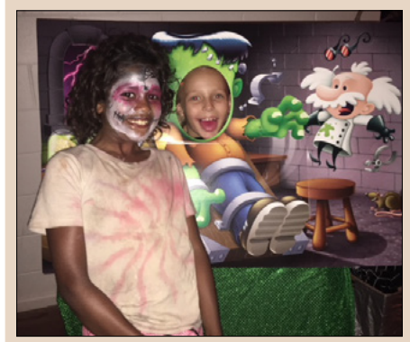
To celebrate Halloween in 2019, there will be an exciting Halloween Disco in Jabiru on Thursday, 31 October from 6pm at the Jabiru Community Hall.

If you have an upcoming event you would like to see listed in this space please phone the Wire on 8979 9465 or email wire@westarnhem.nt.gov.au.