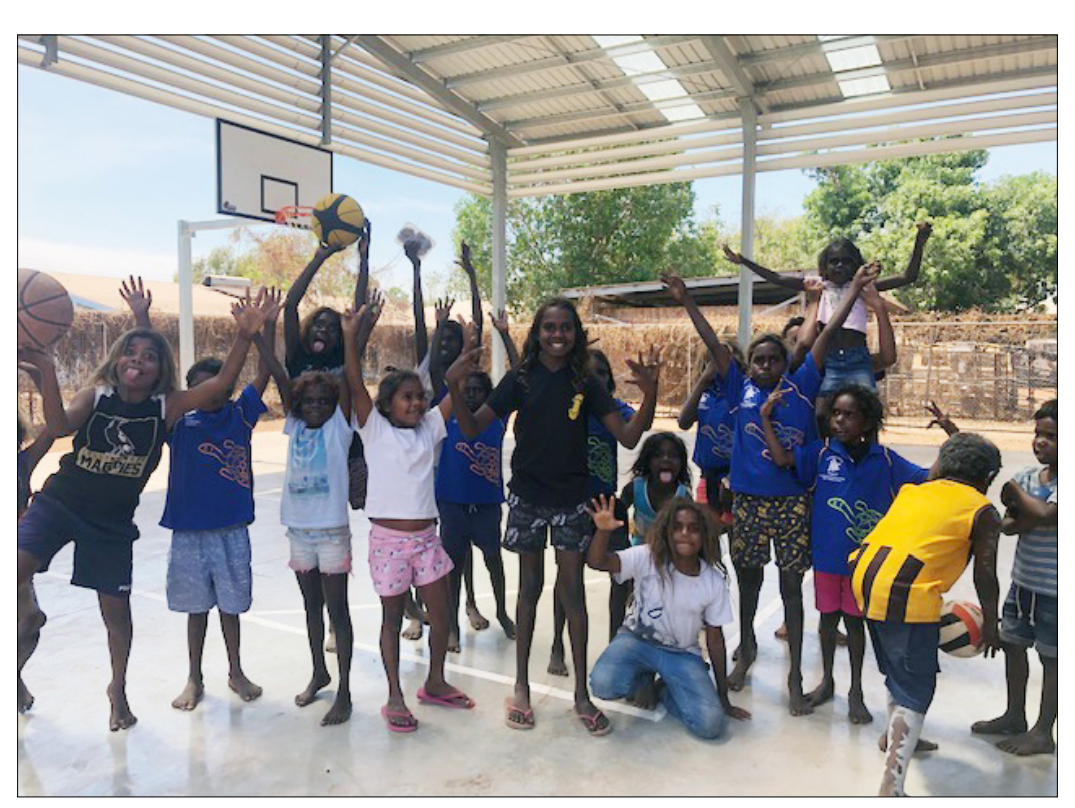
Gunbalanya Youth Centre has been a hive of activity with the welcomed addition of the newly-installed half basketball court. The multipurpose space is also equipped for a variety of different sports and is an event and performance venue for the community.

wire@westarnhem.nt.gov.au 08 8979 9465 Published by West Arnhem Regional Council