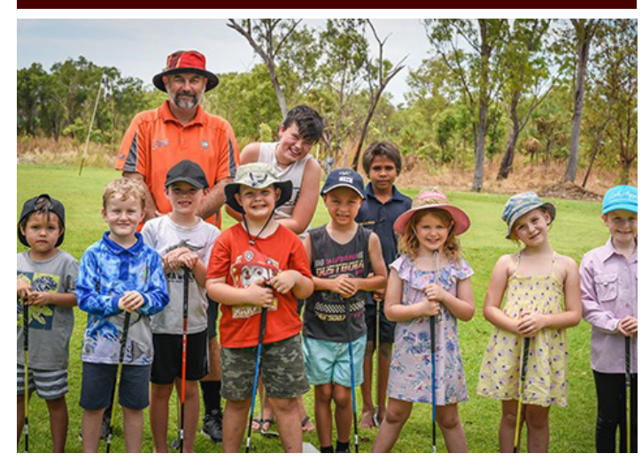
Junior golf was supported by Golf NT and will continue for youth during Term Four.

Young people from Jabiru and surrounding areas have enjoyed the fun and games of the recent school holiday program.