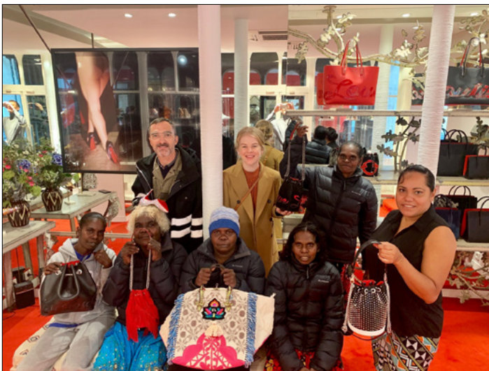
Babbarra Women's Centre artists and managers in Paris.