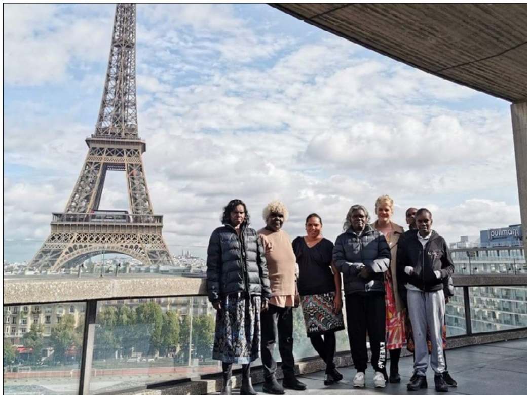
Bábbarra Women's Centre artists and managers travelled to France during September and October to open their exhibition titled 'Jarracharra' which has been showcased to the world.