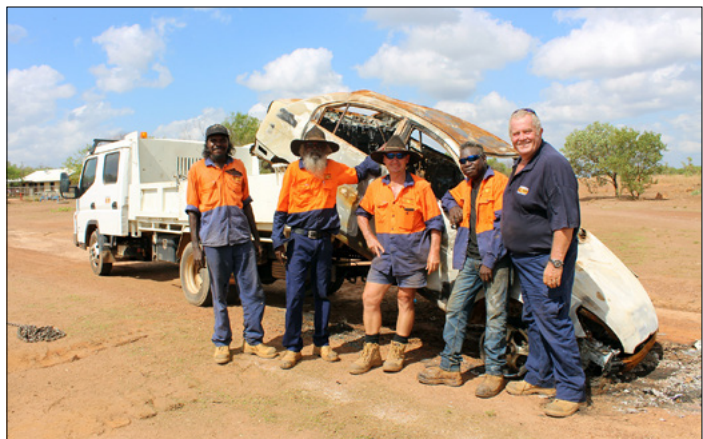
The WARC works crew in Gunbalanya doing a great job removing abandoned car bodies from around the community.