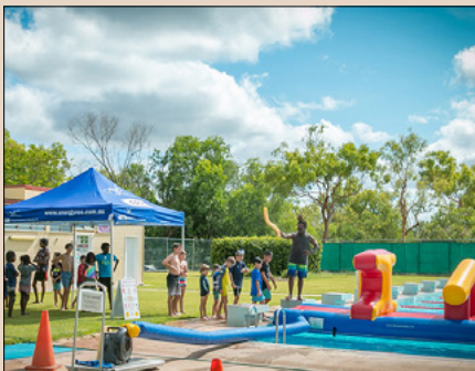
Registrations are open for the 2019 Jabiru Community Children's Christmas Party on Saturday, December 7.

If you have an upcoming event you would like to see listed in this space please phone the Wire on 8979 9465 or email wire@westarnhem.nt.gov.au .