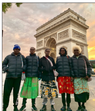
The Bábbarra artists enjoying the tourist sites around Paris during their recent visit.

The Jarracharra exhibition was opened on October 3 with a huge audience from