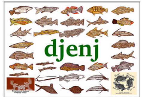
The Djenj Project: Bininj Fishing Past, Present and Future.

This book has names of fish in Bininj Kunwok languages as well as fish words and phrases, parts of a fish, fishing place names, stories and other things, all with audio so you can hear it all in language.