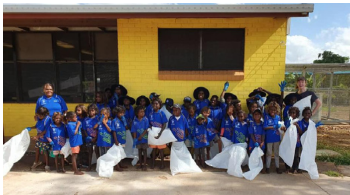
The students and staff of Gunbalanya Community School did a wonderful job picking up rubbish around the community during healthy skin week on Thursday.