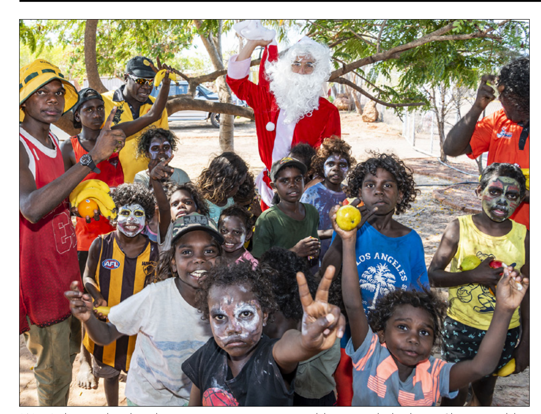
West Arnhem residents have been enjoying many community celebrations in the lead up to Christmas and the festive season. Read more about these celebrations in Jabiru, Maningrida and more on pages 2 - 9.

wire@westarnhem.nt.gov.au 08 8979 9465 Published by West Arnhem Regional Council