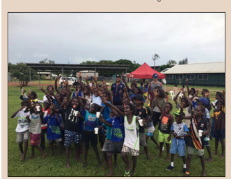
West Arnhem communities will celebrate Australia Day on January 26. Pictured is the 2019 festivities in Gunbalanya which included AFL clinics and a community barbecue.

If you have an upcoming event you would like to see listed in this space please phone the Wire on 8979 9465 or email wire@westarnhem.nt.gov.au.