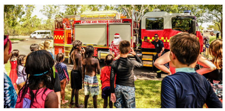
Santa delivering lollies with his helpers to the community.

Also, thanks to the Pool staff for keeping everyone safe during the day and a big thank you to everyone that attended the event and made the day so special!