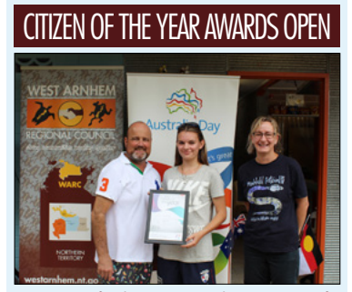
Nominations for the 2019 Australia Day Citizen of the Year Awards open. PAGES 2 >