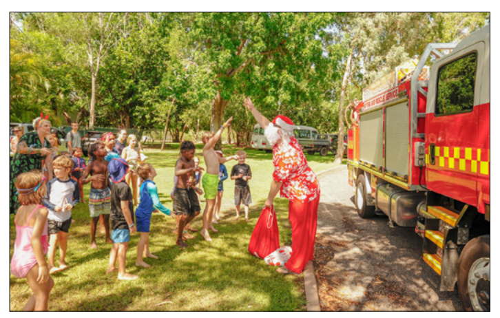
Santa arrived in the fire truck to deliver lollies.

It's about seeing, hearing and learning the 65,000+ year history of this country – a country that was criss-crossed by generations of brilliant Nations.