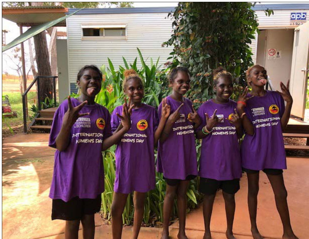
The Maningrida Girls Dance Troupe performed at the International Women's Day Luncheon hosted by Malala at Dhukurrdji Lodge. They performed in front of around 50 women from the community, including family members and stakeholders. Read more, Page 3.