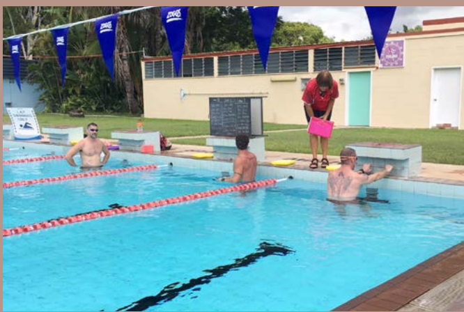
The Kakadu Triathlon 8-week training has begun in Jabiru.

The 2020 Kakadu Triathlon training began this week with a number of local budding competitors taking the opportunity to improve their skills before the big event on Saturday, 9 May.