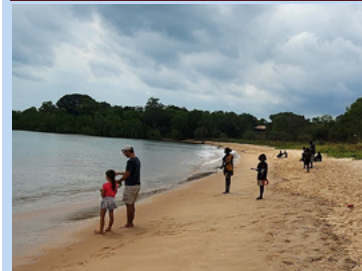
Maningrida youth enjoyed the jam-packed school holiday program recently.