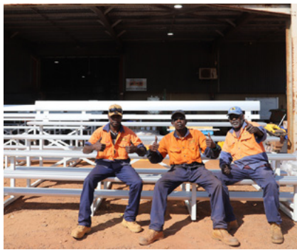
(above) West Arnhem Regional Council's works crew in Maningrida assembling the new grand stands for the football oval.