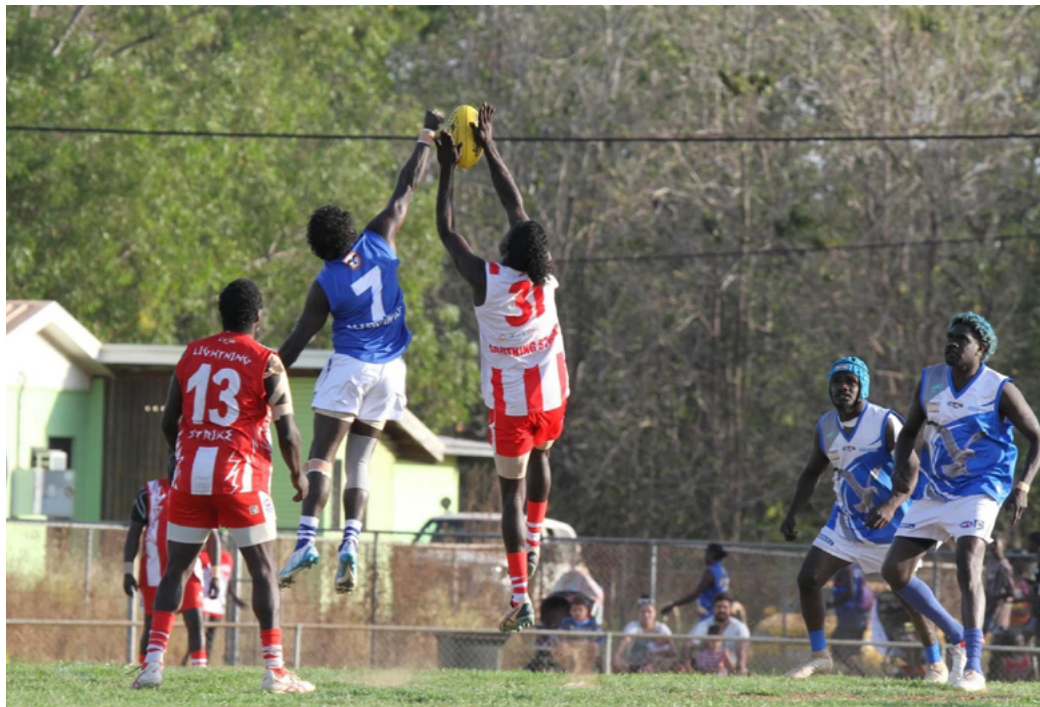
The Maningrida 2023 AFL football competition grand finals were held on Saturday, 12 August. The football oval was looking its best for the big event. Read more, Page 6.