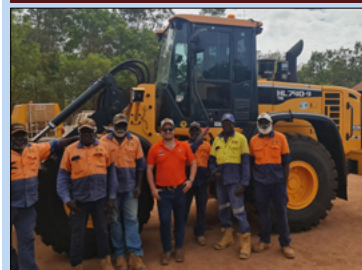
West Arnhem Regional Council's works crew in Waruwi welcome new machinery.