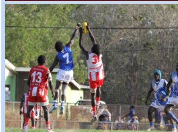
2023 Maningrida AFL competition grand final matches played on Saturday, 12 August.