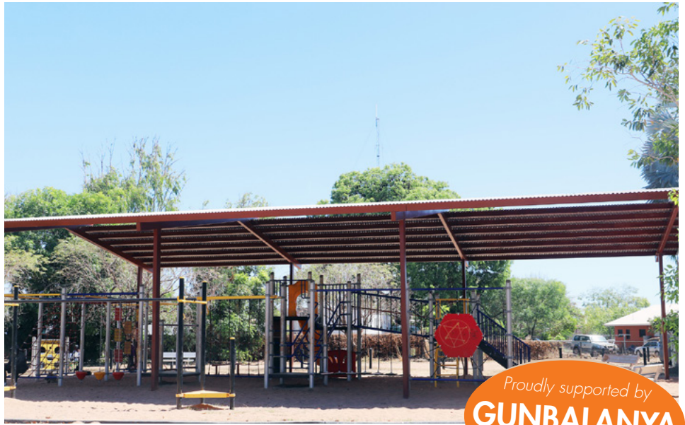
The Gunbalanya playground shade structure was recently extended and additional chairs installed thanks to the Gunbalanya Local Authority.

Thank you to the Local Authority for supporting this key project which strengthens sense of belonging in community.