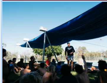
Young people in Jabiru treated to a swim clinic with Olympic gold medalist Mack Horton recently.