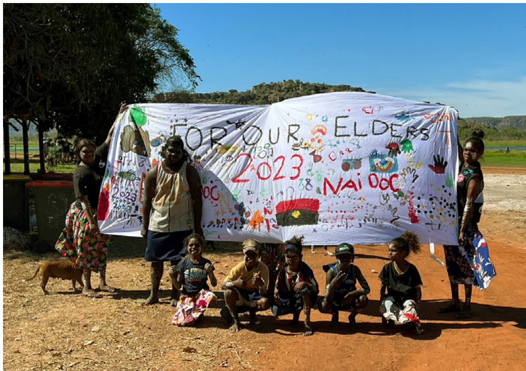
Gunbalanya celebrated NAIDOC Week with an exciting whole-of-community event on Friday, 14 July. The event centred around the 2023 NAIDOC theme 'For Our Elders'. Read more, Page 3.