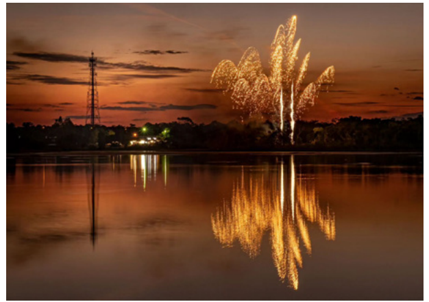
Territory Day 2023 in Jabiru, Photo credit: Peter Keepence Photography