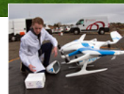
Medical worker loads vital medication for Bibi plane delivery