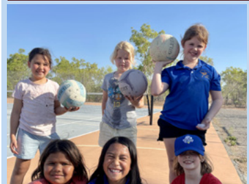
The youth in Jabiru have been progressing their basketball and netball capabilities.