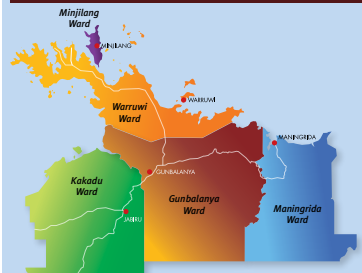
NT Electoral Commission declares result for the West Arnhem Regional Council, Kakadu Ward by-election.