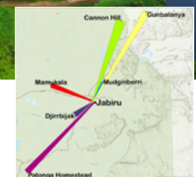
Map of the Bibi plane delivery flight routes

Bibi planes are pilotless aircraft and are already improving the delivery of medicines and other health care products to remote communities across Africa and Asia. West Arnhem will be the first trial of Bibi planes in Australia.