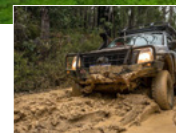
Road access to communities can be challenging in the wet