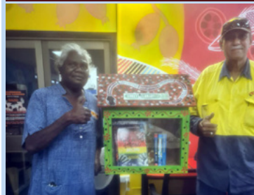
Jabiru's street library officially registered and mapped with Street Library Australia!