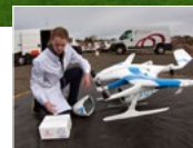
Medical worker loads vital medication for Bibi plane delivery