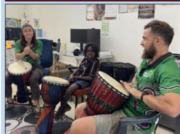
Council's Youth, Sport and Recreation team had an action-packed school holiday program in Jabiru.