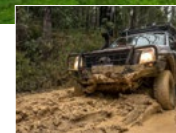
Road access to communities can be challenging in the wet