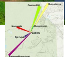
Map of the Bibi plane delivery flight routes

Bibi planes are pilotless aircraft and are already improving the delivery of medicines and other health care products to remote communities across Africa and Asia. West Arnhem will be the first trial of Bibi planes in Australia.