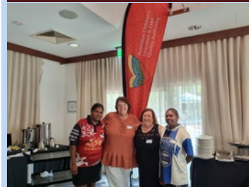
Quality and Safety Training Workshop was held in Darwin on 10 and 11 October 2023.