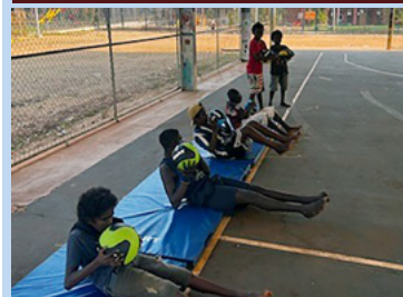
Young people in Maningrida have been getting active recently utilising the youth mobile gym.