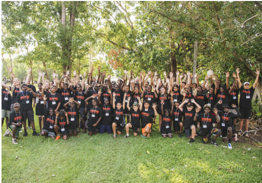
The inaugural West Arnhem Youth Leadership Summit was held on 7 and 8 November with more than 50 attendees from all West Arnhem communities.