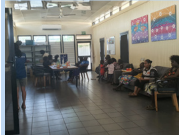
Gunbalanya Safe House collaborate with NT Health Team to put together a 'Health and Wellbeing Day'.