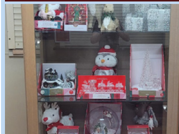
The Jabiru and Maningrida Post Offices are getting into the festive spirit! Pop in and have a browse.