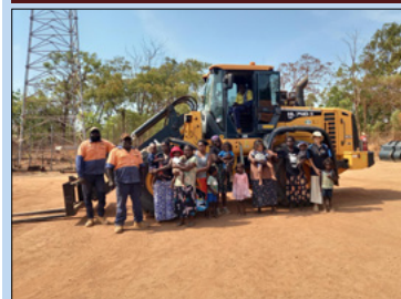
Waruwi Preschool and Families as First Teachers (FaFT) visit Council's workshop recently.