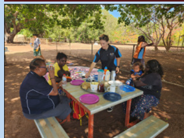
West Arnhem Regional Council and Families as First Teachers host a pancake breakfast for mums.