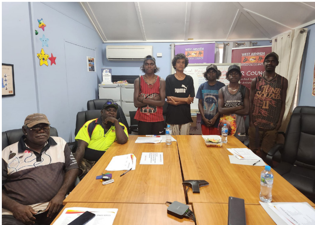
The Men's Yarning Space is facilitated by West Arnhem Regional Council's Community Safety team in Warruwi which sets out to create a safe space for our young men in Warruwi.