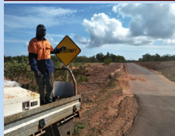
Council's works crew in Maningrida have been busy installing new road signage in the community.