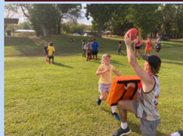
The Jabiru 'Baby Bombers' Auskick Final will be held on Monday, 4 December. All welcome.