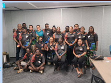
Aboriginal leaders from the NT address the highest level of Government at a special Cabinet meeting.