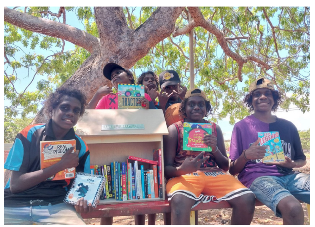
Warruwi has launched a new street library which is now proudly located at the Warruwi school. Read more about the new Street Libraries across the region on Page 5

wire@westarnhem.nt.gov.au 08 8979 9465 Published by West Arnhem Regional Council