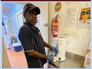
There is lots happening at the Gunbalanya Community Care Centre.