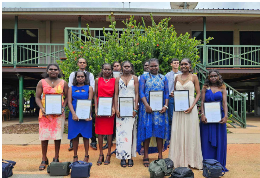
Congratulations to the students who attended their graduation ceremony in front of family, friends and the wider community.