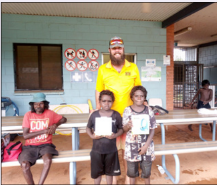
West Arnhem communities will celebrate together on Friday, 26 January 2024. See community event details on pages 8 & 9.