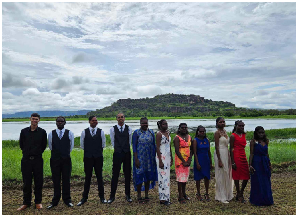
Eleven students from Gunbalanya School graduated with their Northern Territory Certificate of Education at a special ceremony on Thursday, 11 January 2024.