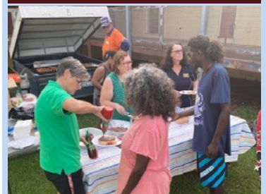
More than 50 Community members turn out to celebrate Minjilang Day.