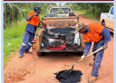
Council's works crew have been doing a great job carrying out road repairs this wet season.