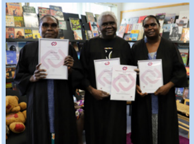
Kakadu Community Care team complete Certificate IV in Community Services.