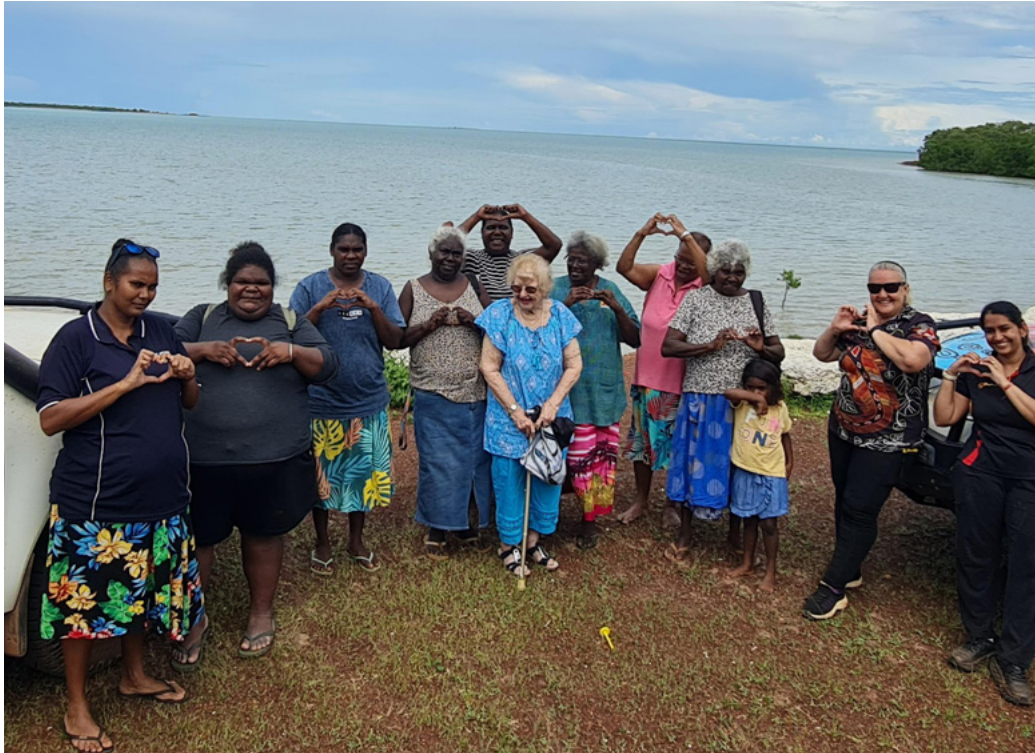
The Warruwi Community held a lovely afternoon tea to celebrate International Women's Day on Friday, 8 March. The theme this year was Inspire Inclusion. Read more, page 2.